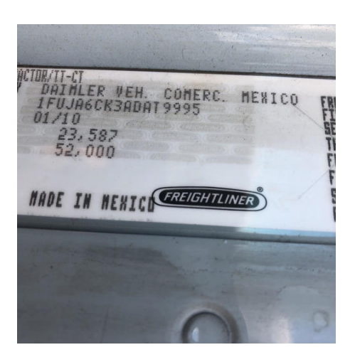
VIN Driver Side Door (if missing take where would appear)