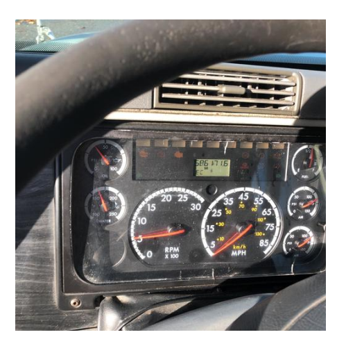
Dashboard Full View (key on if available)