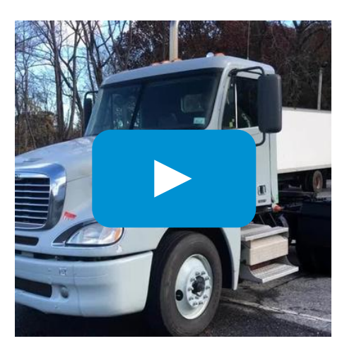
Truck Moving Forwards and Backwards