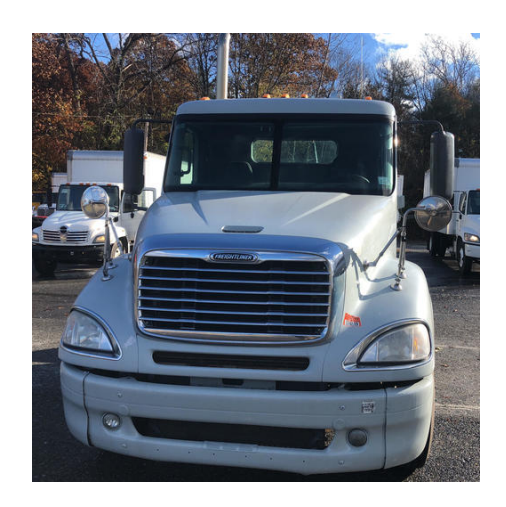
Front Full View