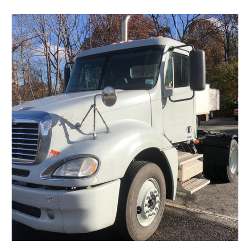
Driver Side Front Corner Full View