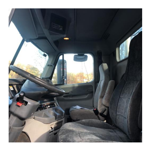
Driver Side Interior Full View