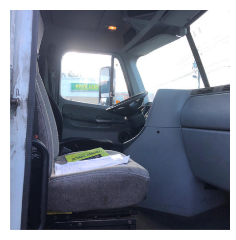
Passenger Side Interior Full View