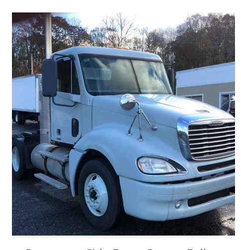
Passenger Side Front Corner Full View