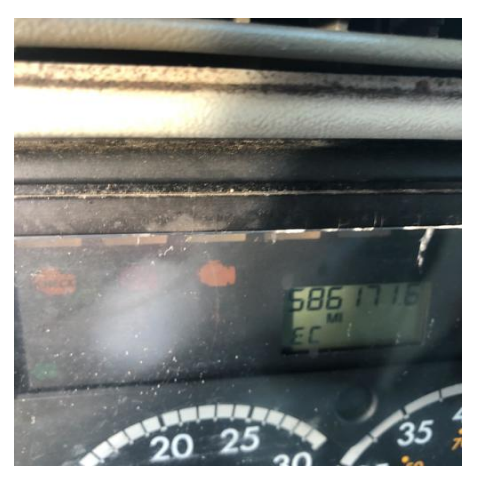
Odometer/Hours Reading (key on if required/available)