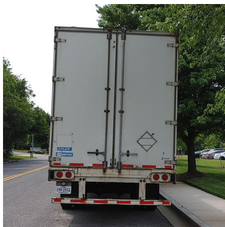
Rear Full View