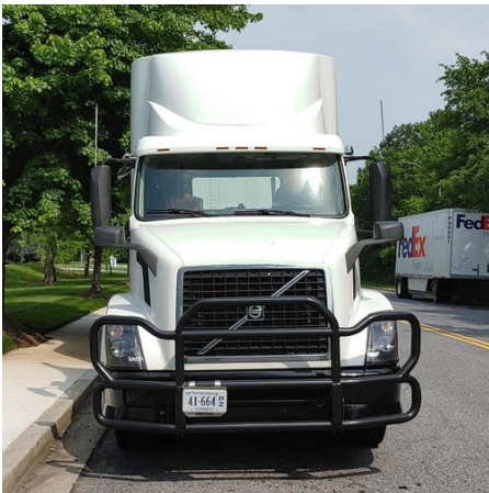
Front Full View