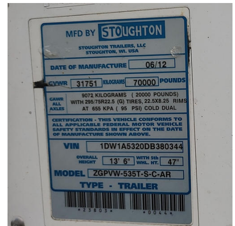
VIN Driver Side Door (if missing take where would appear)