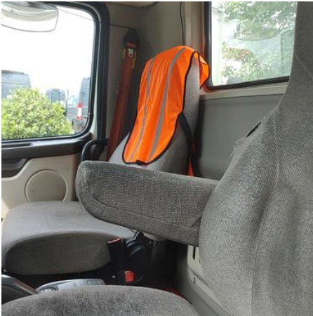
Sleeper Cab/Rear Interior 1 (if applicable)