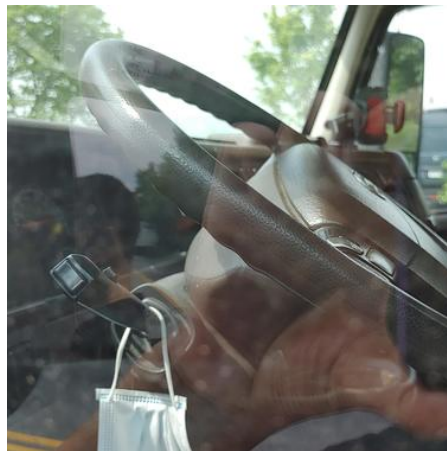
Dashboard Full View (key on if available)