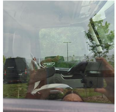
Passenger Side Interior Full View