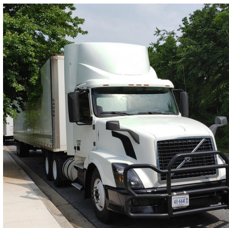
Passenger Side Front Corner Full View