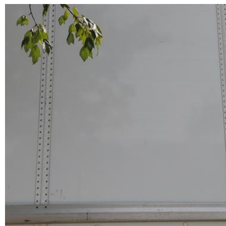
Passenger Side Full View