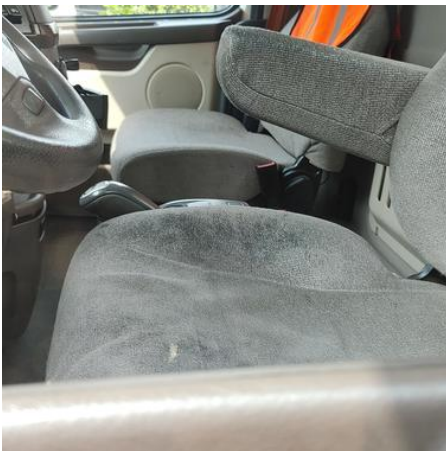
Driver Side Interior Full View