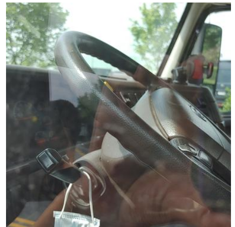
Odometer/Hours Reading (key on if required/available)