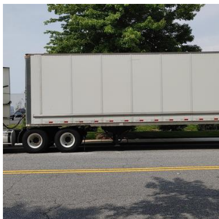
Driver Side Full View