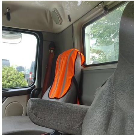
Sleeper Cab/Rear Interior 2 (if applicable)