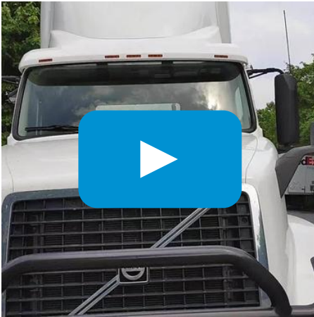
Engine Running Hood Up (showing timing belts etc)