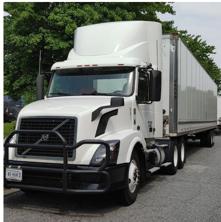
Driver Side Front Corner Full View